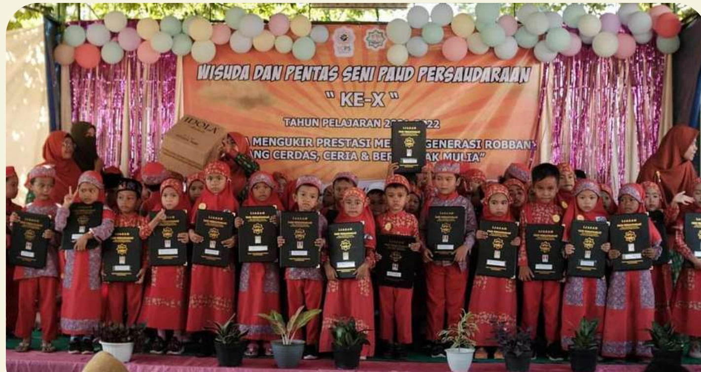
60 students successfully graduated from school