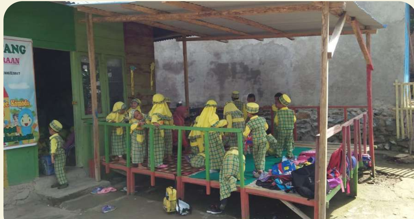
Then - before rebuilding