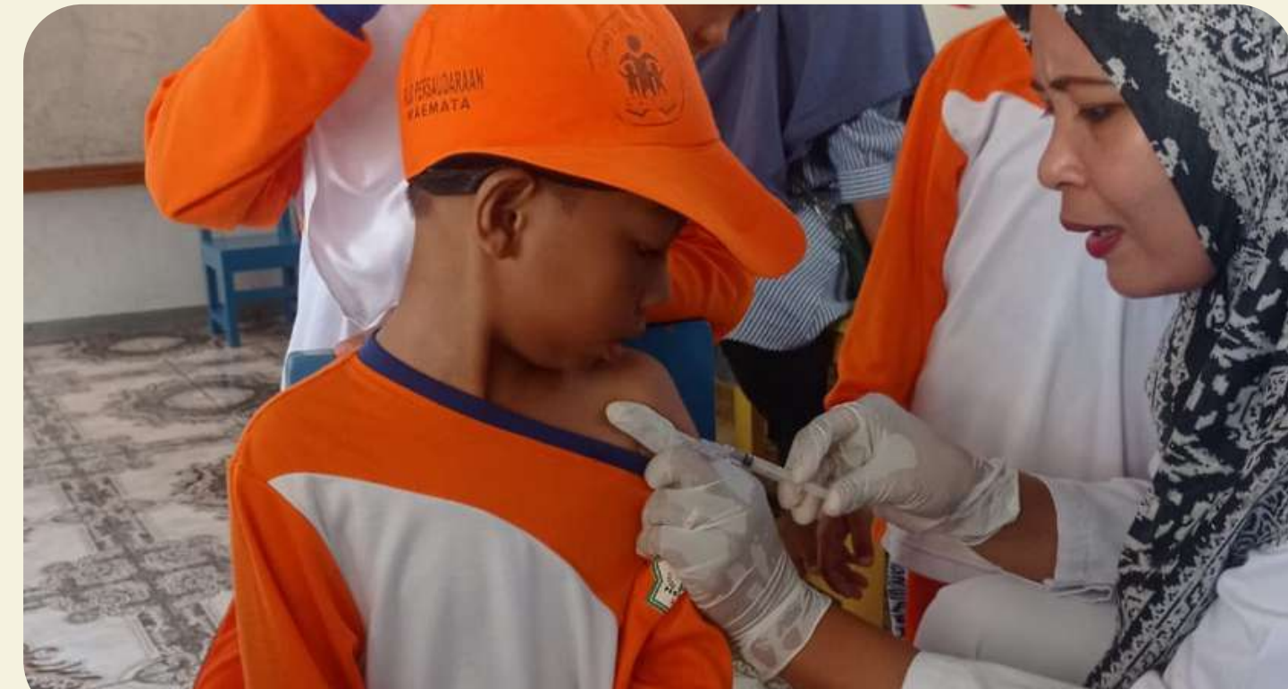
In collaboration with the local health unit, routine vaccination and nutritional food program are carried out