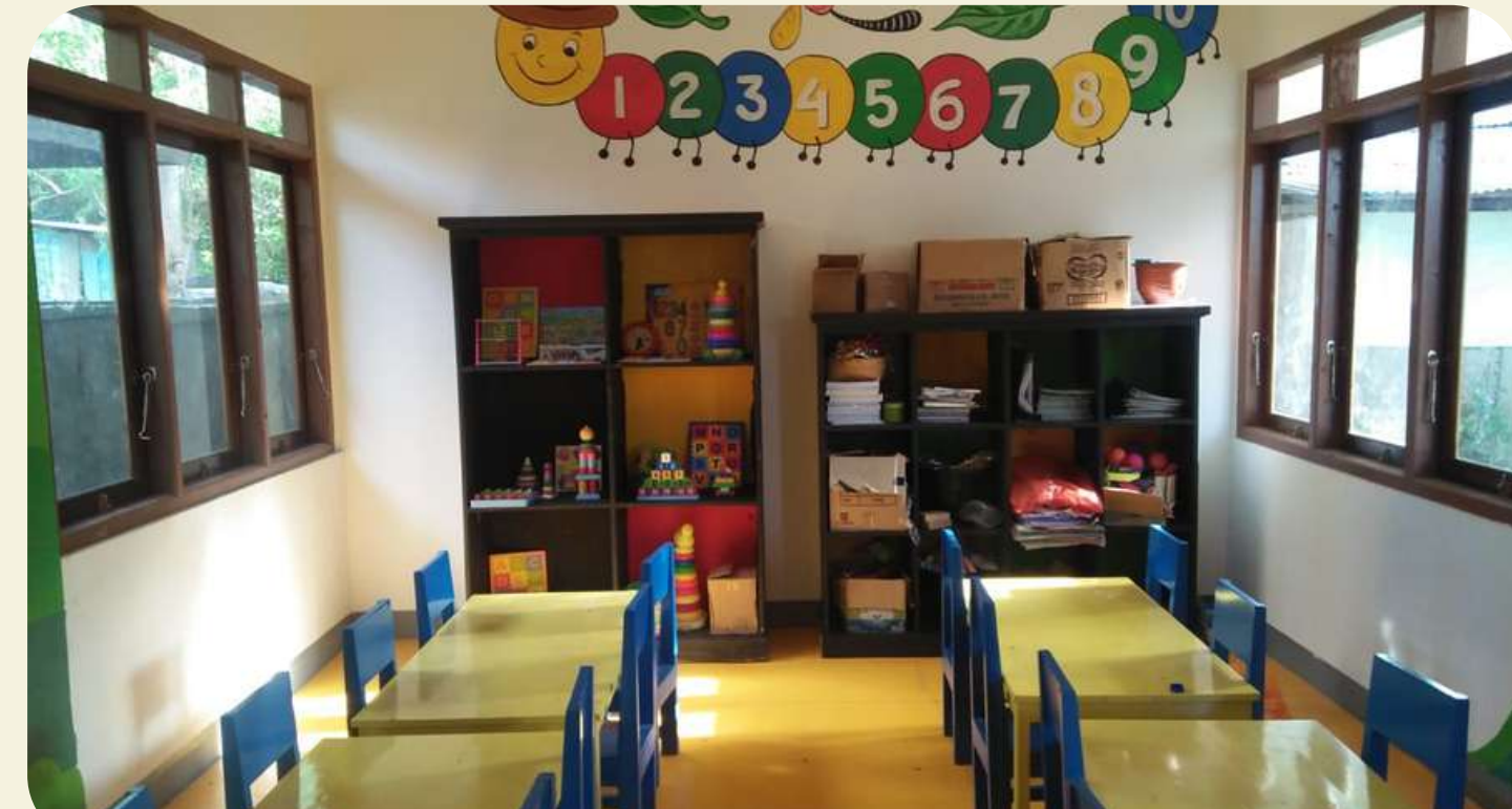
2019 - after rebuilding