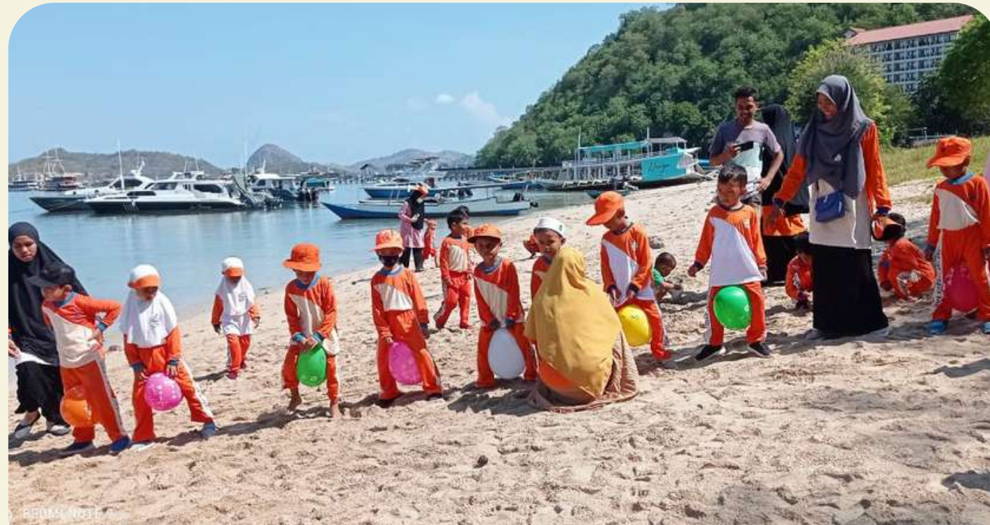
Field trip activities are routinely carried out at the end of each semester