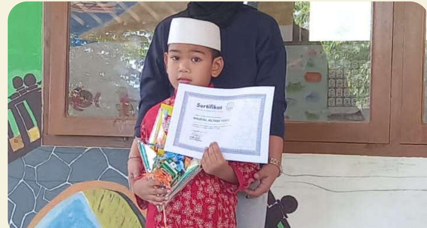
Children who excel in school receive special award certificates